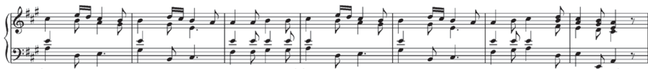
Figure 6. Recomposition of Figure 2 to prevent cadence at bar 4.

the melody note B while in bar 1 a slur would begin on the first C sharp and end somewhere beyond the end of bar 1. (In making this claim, we follow the procedure of music theorists who rely on their own intuition about the structure of a piece of music, tested by repeated listening and introspection. We furthermore assume that other listeners will have the same intuitions as ours. We judge that for our present purposes the cost of proper scientific listening tests is not warranted, but we would be interested to hear if other listeners do not share our intuitions.)