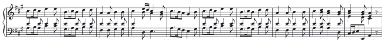
Figure 5. Recomposition of Figure 3 to recreate four-bar phrase.