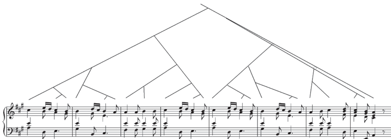
Figure 2. Recomposition of Figure 1 to place a copy of bar 4 at the beginning.

them in a precise fashion. (Instead, one is given the strong impression that only geniuses have true understanding of the laws!) Lerdahl & Jackendoff, by contrast, give a large set of rules to relate notes to analyses. However, as frequently pointed out, some of these are irregular rules in that they state only a ‘preferred’ relation between notes and structures, which need not hold if other rules imply a different relation. How conflicts between preference rules are to be resolved is not specified in the theory.