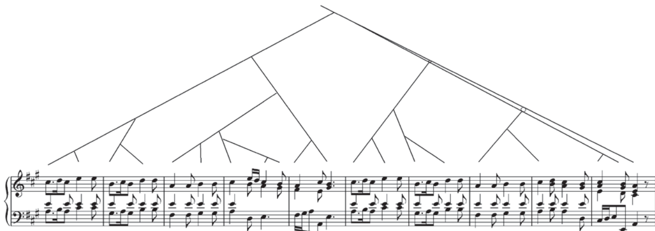
Figure 3. Recomposition of Figure 1 to make five-bar phrases.